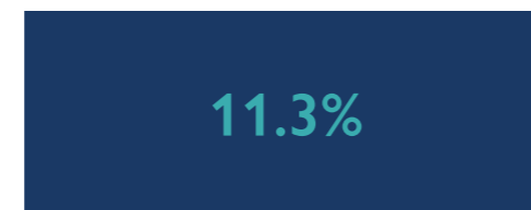
Mean Pay Gap