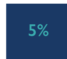
Median Pay Gap