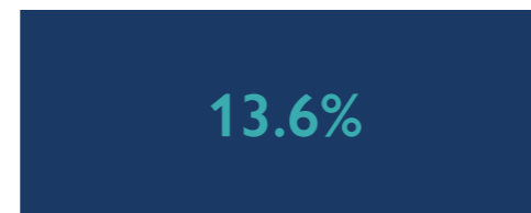
Mean Pay Gap